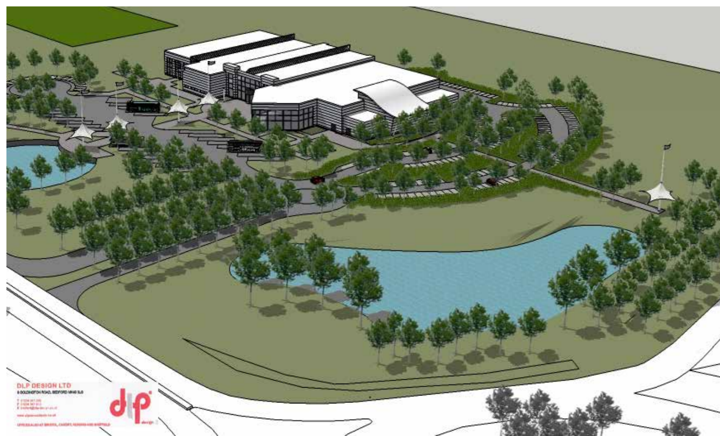
Proposed Initial Masterplan and Visualisation of Scheme by DLP