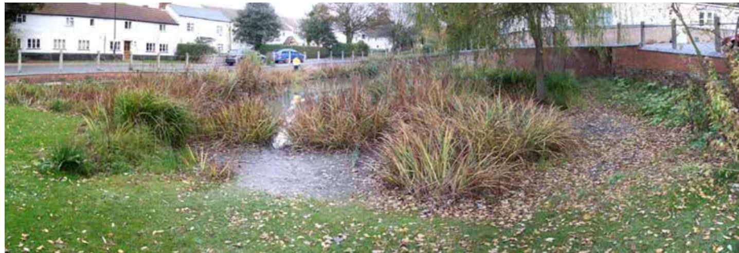
Existing Pond Condition Before Renovation.