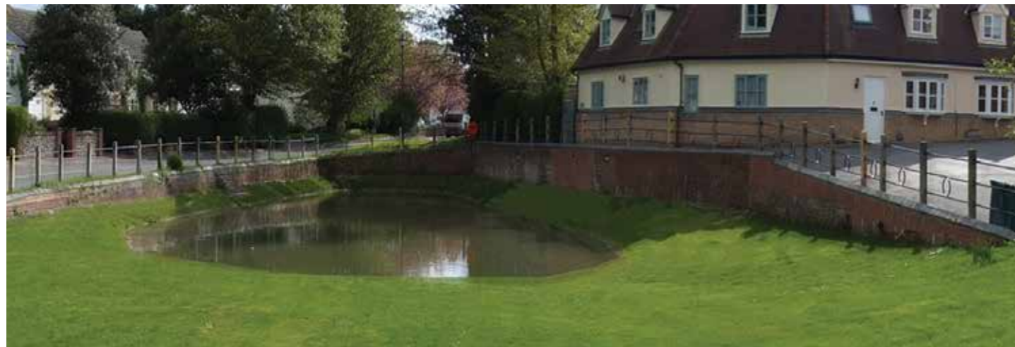
Completed Pond after Renovation.